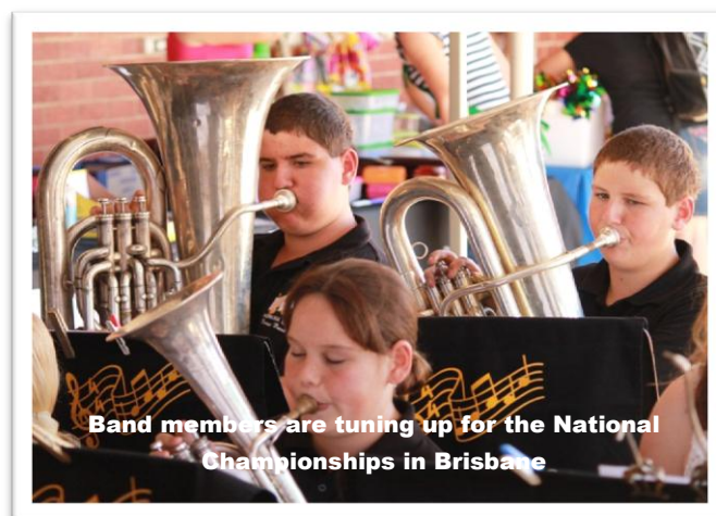
Band members are tuning up for the National Championships in Brisbane

Term two is going to be as busy and exciting as term one, with staff and students looking forward to a productive and enjoyable time ahead.