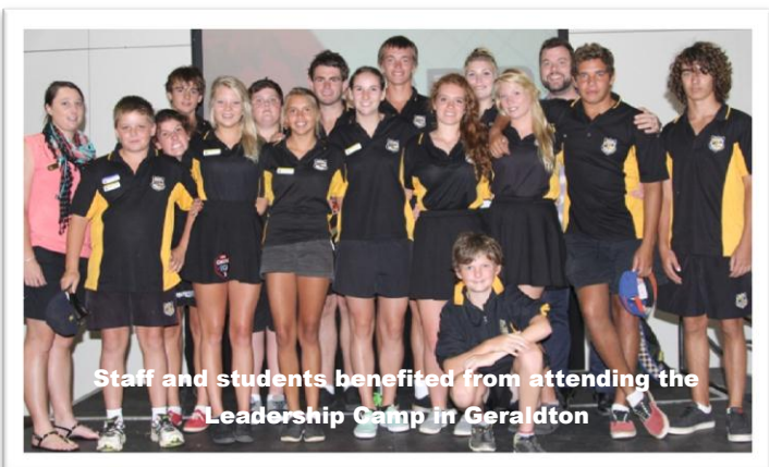
Staff and students benefited from attending the Leadership Camp in Geraldton

To be eligible to attend the prestigious camp, students had to themselves meet a strict code of conduct. They travelled to Geraldton and took part in activities and a planning/ goal setting session culminating in them attending the GRIP (GRIP stands for core values of Generosity, Responsibility, Integrity and People) Leadership Conference on Friday. This conference was specifically designed to equip students with the skills and knowledge they will require to be successful school leaders.