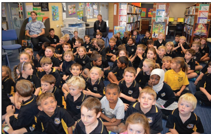
An attentive audience at the teachers' competition.