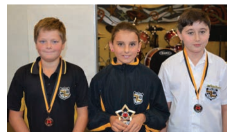
Best speakers in Year 6.