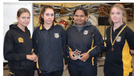
Year 8 finalists ...