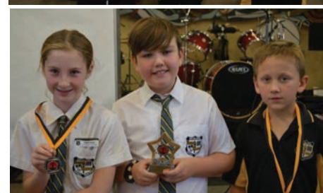
Year 5 victors.