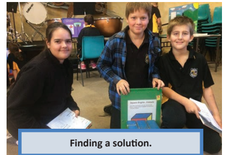
Finding a solution.