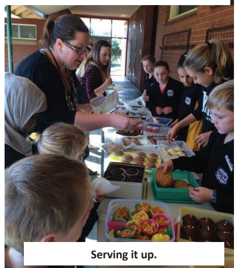
Serving it up.