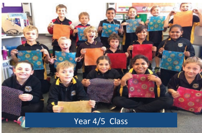
Year 4/5 Class