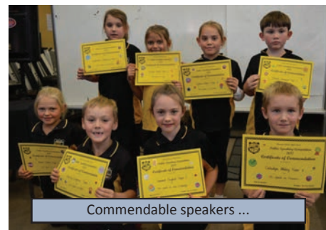
Commendable speakers ...

Congratulations also, to all students for their participation and, in particular, the finalists listed below for their wonderful speeches at the Final.