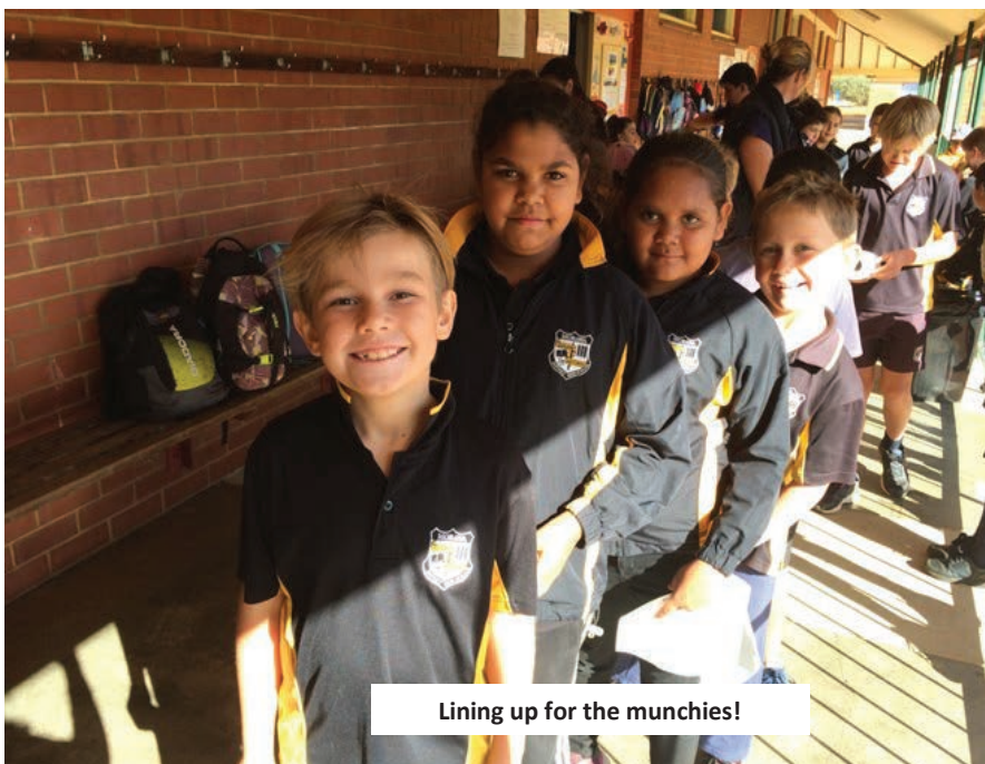
Lining up for the munchies!