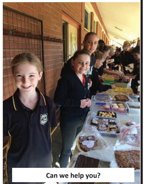
Can we help you?