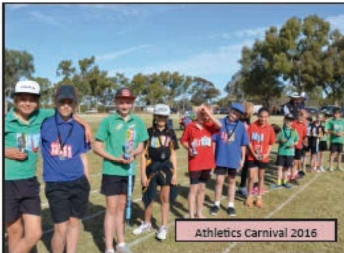
Athletics Carnival 2016