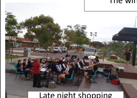
Late night shopping