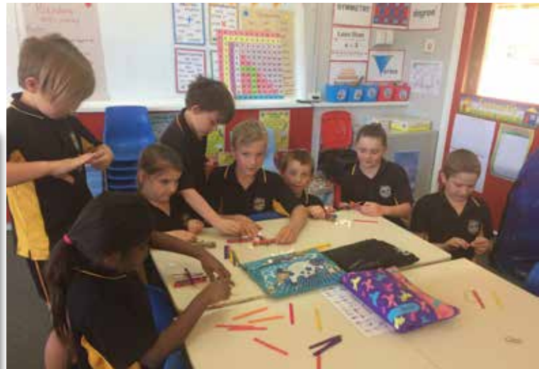
Students making catapults using popsticks and rubber bands that shoot off marshmallows!