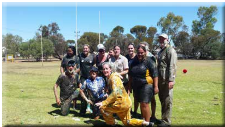
After the battle ... !