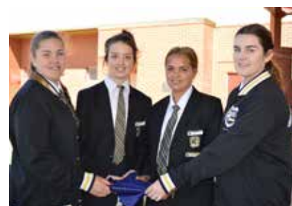
The flag is handed over during the assembly.

The Graduation Ceremony was held after a special dinner for the graduates and their teachers, parents and special guests held at Everlastings Restaurant.