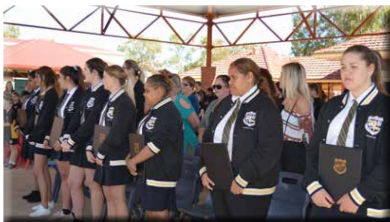
Receiving Graduation Certificates