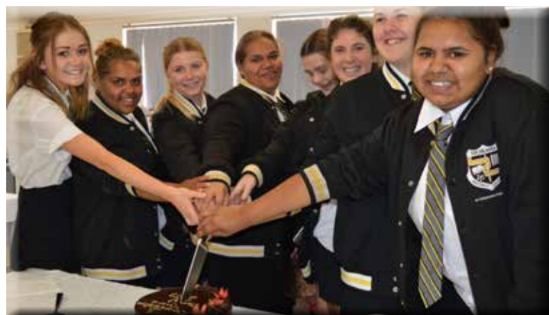
The Year 12s get ready to cut their Graduation Cake!