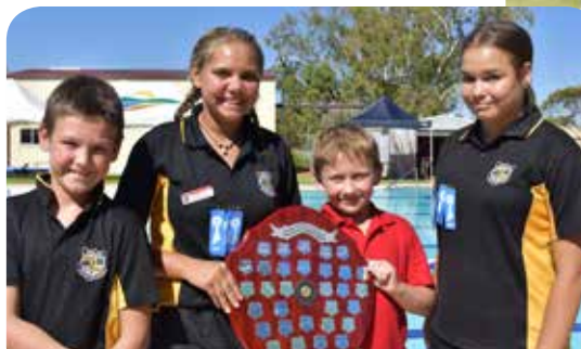
Ruby House Captains celebrate their Swimming Carnival success.