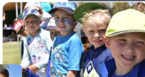
The Sapphire cheer squad cheer on their competitors.