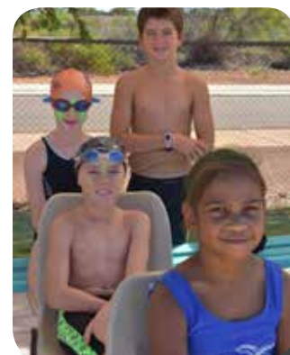
Lining up for cool, pool action ...