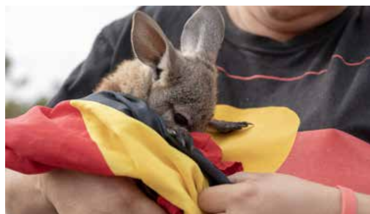
Snug as a bug...