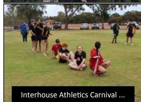
Interhouse Athletics Carnival ...