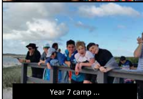
Year 7 camp ...