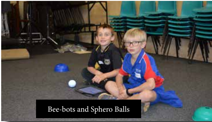
Bee-bots and Sphero Balls