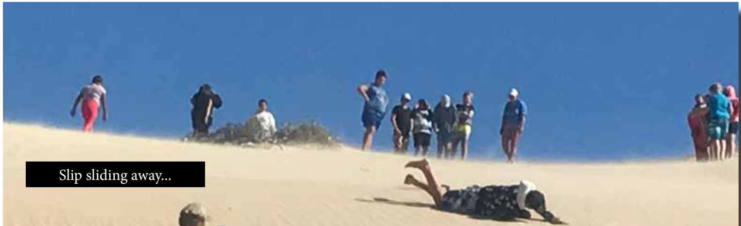
Slip sliding away...

I will always remember: "Seeing the turtles and dolphins on the boat" - Marget Barnes