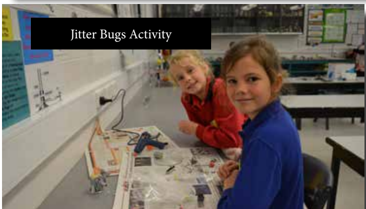
Jitter Bugs Activity