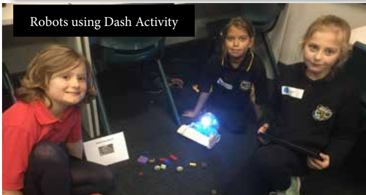
Robots using Dash Activity