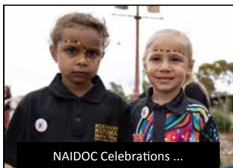
NAIDOC Celebrations ...

The events, activities and achievements at the school this term have been very exciting.