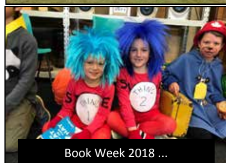
Book Week 2018 ...