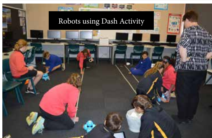
Robots using Dash Activity