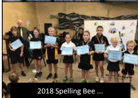
2018 Spelling Bee ...