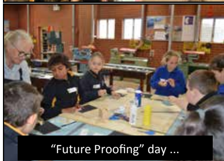
"Future Proofing" day ...

The term began when we celebrated the Morawa Community NAIDOC Event. This was followed by the Interschool Cross Country, the Year 7 Camp to Coral Bay and the Interschool Spelling Bee.