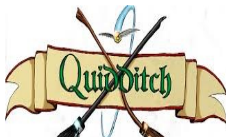
Anyone for Quidditch?

And of course all of these activities have been fitted around our very successful teaching and learning programs that have continued throughout the term!