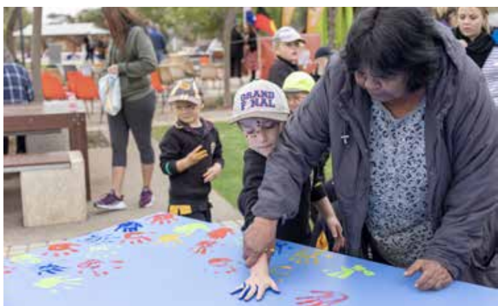
Making of the mural