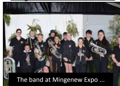
The band at Mingenew Expo ...