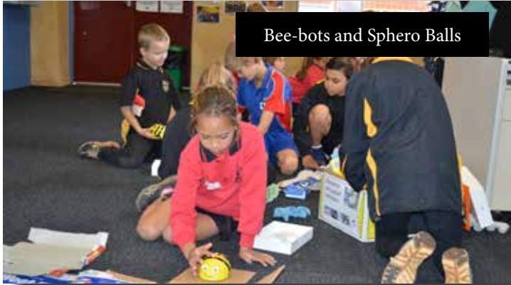
Bee-bots and Sphero Balls