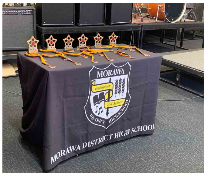
The medal table.....