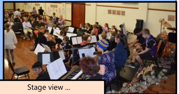
Stage view ...