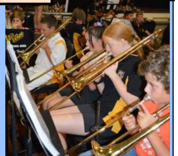
And the band played on ...