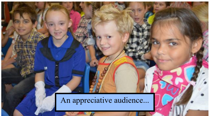
An appreciative audience...