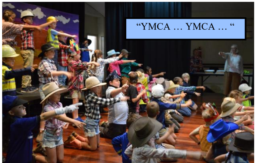
"YMCA ... YMCA ..."

The two-hour presentation ended with a slide show, which celebrated student activities throughout the year.