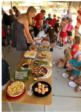
All the beautiful food!