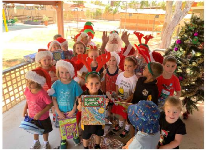
All the students with Santa!