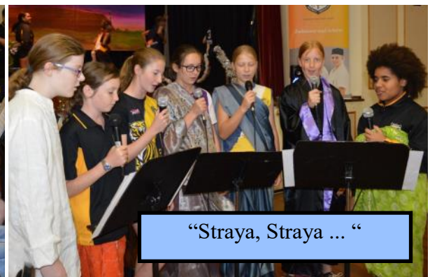
"Straya, Straya ..."