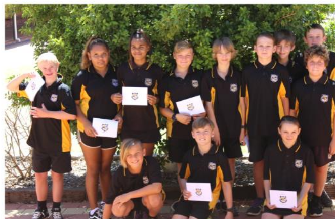
Our Year 6 graduating class!