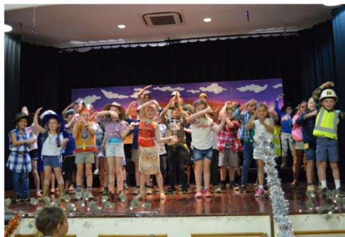
Year 1/2 & 3/4 class 'YMCA'