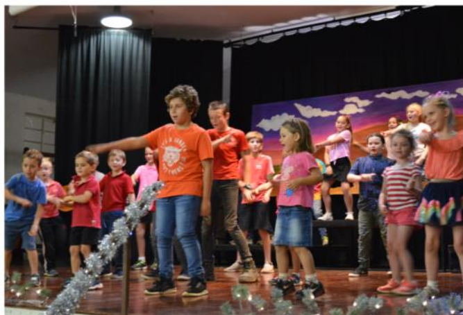
Pre-primary Year 5 & 6 'Jail House Rock'