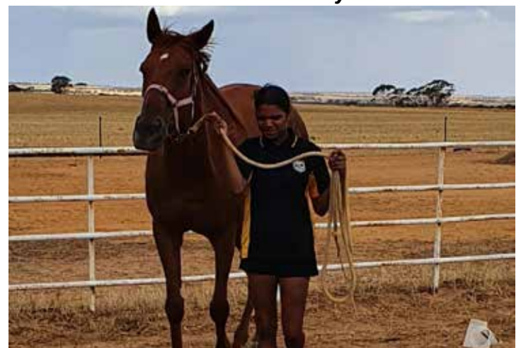
Equine at WACOAM