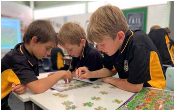
AN INTENSE MOMENT!