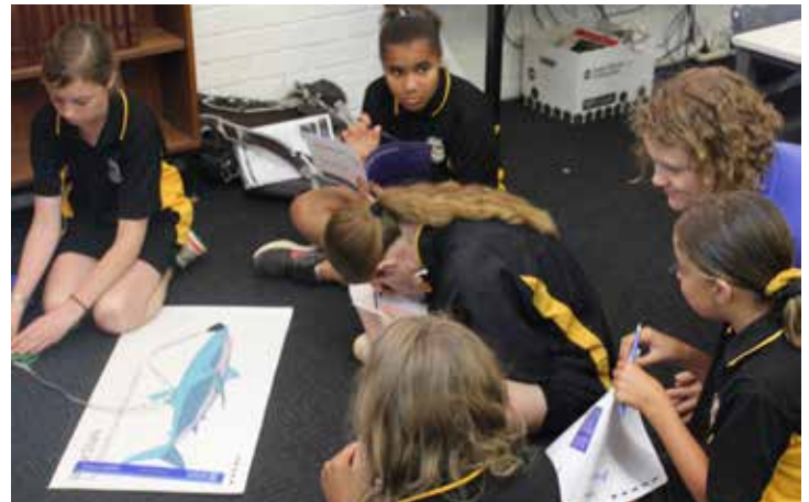
CIRCLING THE SHARK ...