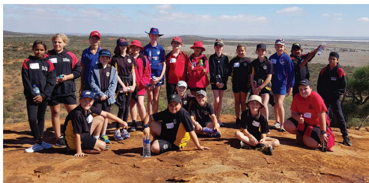
The only way is up ...!

Students transitioning into Year 7 High School classes in 2021 proved they were able to scale challenging heights when they climbed the rocks at Koolanooka Springs on September 16. The bush walk was followed by a creative painting session at school, lunch and games and activities at the Morawa Youth Centre. It was the second day of the school's transition program and all students from the school and from Perenjori and Three Springs enjoyed the day.