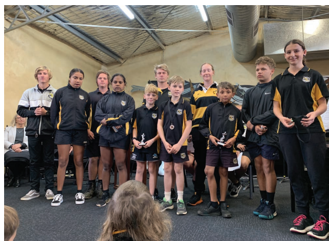
Interschool Athletics Champions & Runner-up Champions