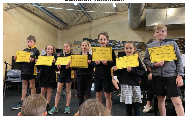
Class Dojo Winners