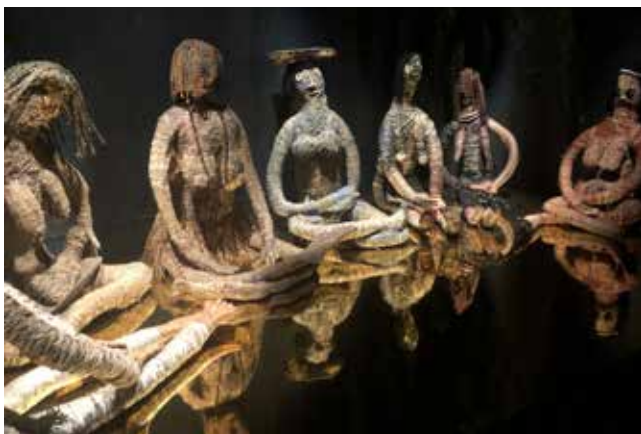
WA Museum visit ... the Seven Sisters in the Boola Bardip Exhibition

Students at Winthrop Hall ... great aspirations!