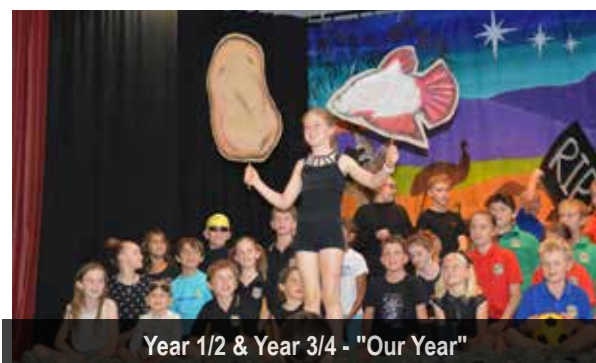
Year 1/2 & Year 3/4 - "Our Year"