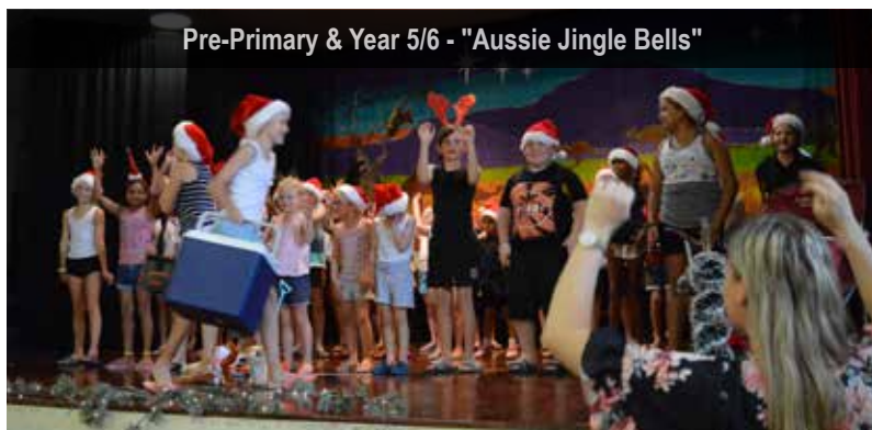
Pre-Primary & Year 5/6 - "Aussie Jingle Bells"

A huge thank you to you all for organising this wonderful event; the class items, the music ensembles and band items, the choir items, props, the program, book prizes and scholarships, the slideshow, backstage help and the beautiful luncheon etc. WOW! It was such a great way to celebrate the year. Thank you! What a wonderful example of team work! We have a wonderful school community and it was wonderful to share that with the extended North Midlands community.