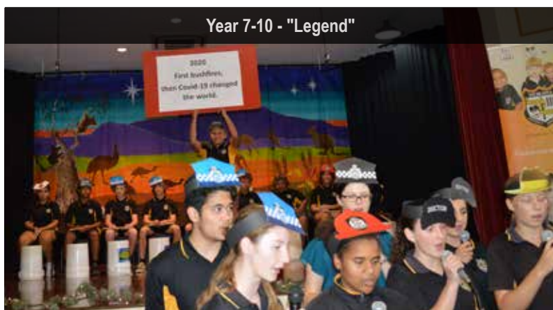
Year 7-10 - "Legend"

Another highlight was the presentation of Subject and Year Awards and the announcement of scholarship winners (details inside).