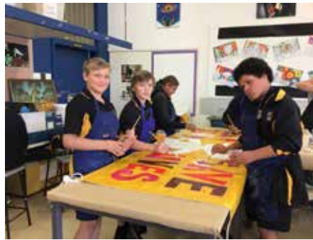
Roadwise banners and satellite dishes.